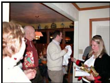
Raffle prizes, photo contest prizes, and perfect attendance awards means the prizes keep on coming