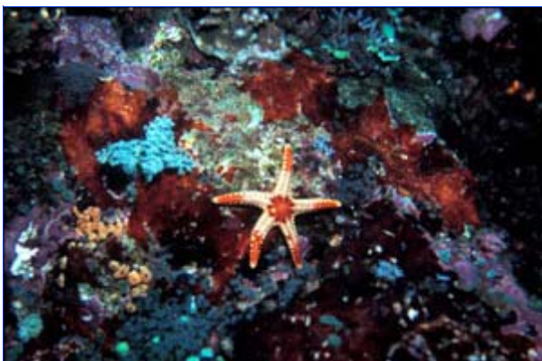
Category: Professional First Place Winner (above)