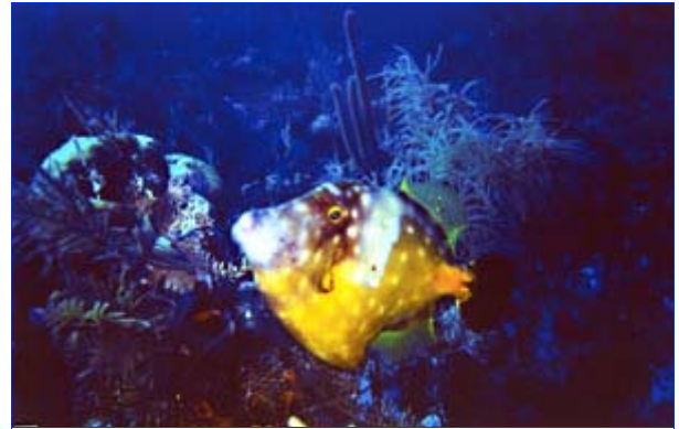
Category: Point & Shoot Second Place Winner (above)