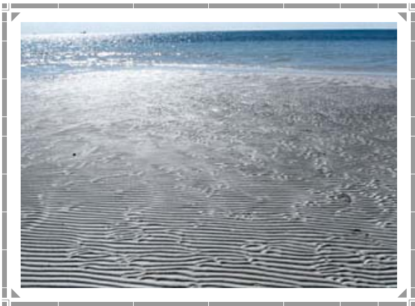
Category: TopSide (& Best of Show) First Place Winner (above)