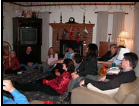
Listening to the announcement of prize winners (above).

Our 2005 Christmas party was enjoyed by members and guests alike. With our, raffle, door prizes, good food, and wonderful friends, there were many wonderful moments for everyone.