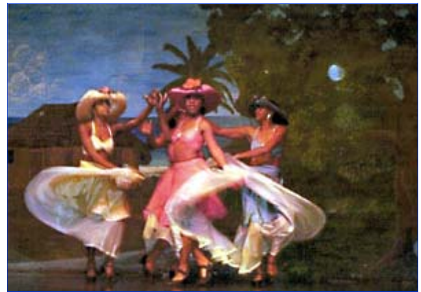
Category: TopSide Second Place Winner (above)