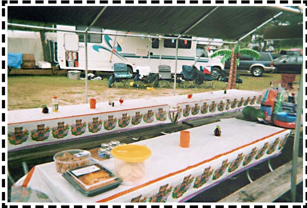
Awaiting on the Hungry