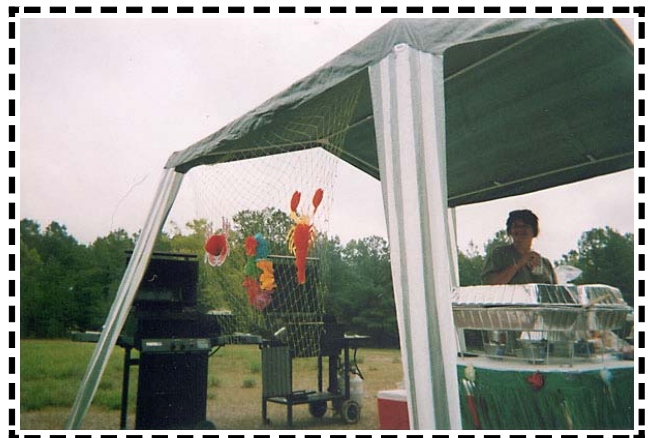
A Touch of the Caribbean

Introduced last year was our underwater Capture the Flag