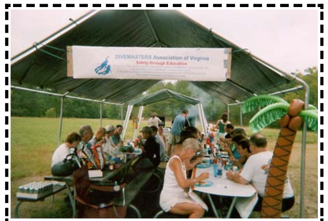
Good Food, Good Company!

Each team places one or two divers 15 feet away from the